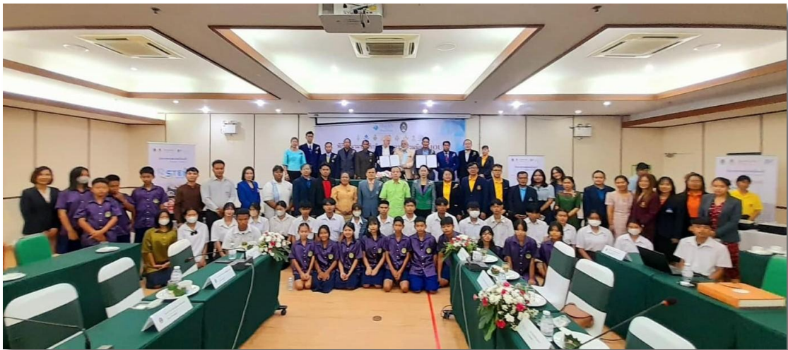
Computer hand-over ceremony at Surin Radjabhat University