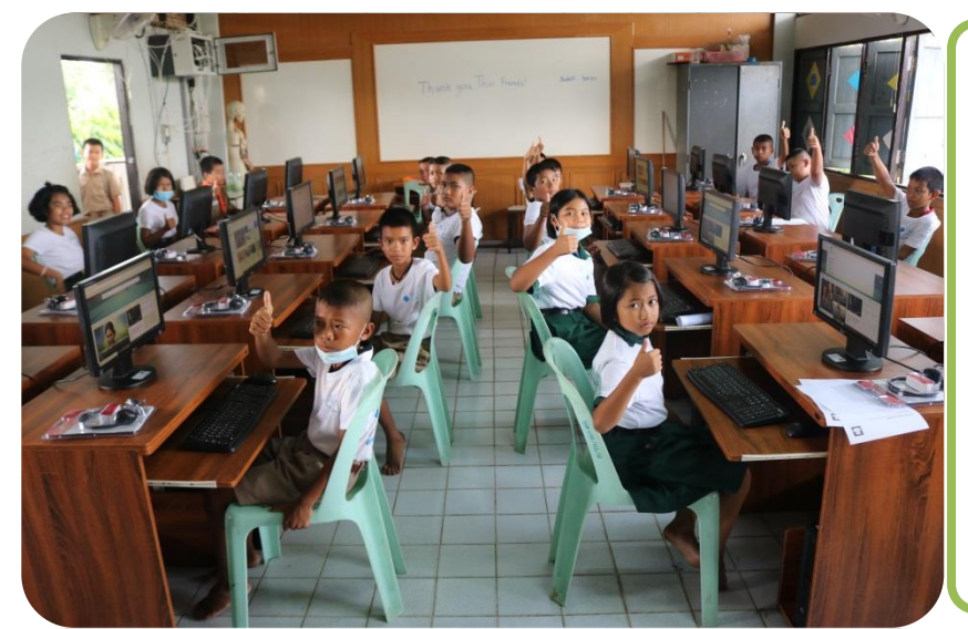
Figure 12: Fund Isaan computer classroom at Ban Puangtuek School sponsored by VZW Thaise Vrienden Wevelgem