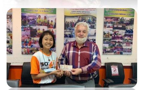
Figure 3: New Scholarship Student 2020-Carrot