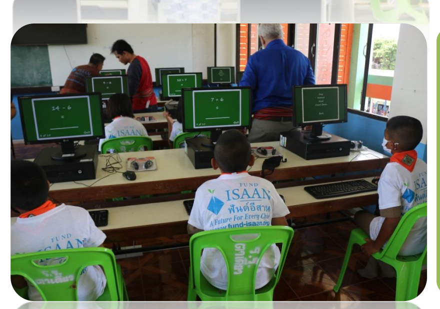
Figure 14: Fund Isaan computer classroom at Ban Tataew School sponsored by VZW Thaise Vrienden Wevelgem