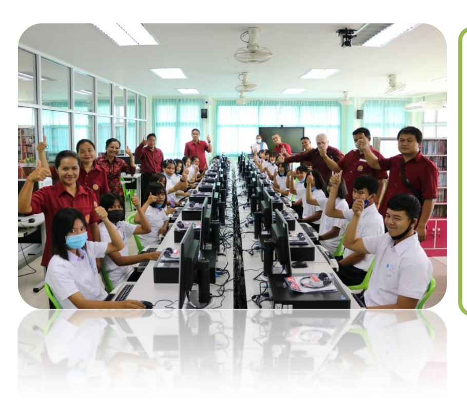
Figure 11: Fund Isaan computer classroom at Sangkha Industrial and Community College sponsored by Deloitte SEA

Moreover, with the support from our new sponsor, VZW Thaise Vrienden Wevelgem, we were able to install five new computer classes in rural schools in the province of Surin. This gift was extremely welcome as several of the fund raising events annually organized by our sponsors could not take place following the corona-crisis.