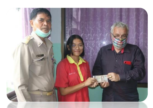
Figure 1: New Scholarship Student 2020-Am