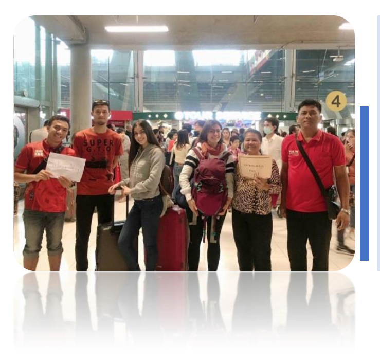
Figure 21: Teachers and staff pick-up Fund Isaan volunteers at Suvarnabhumi Airport