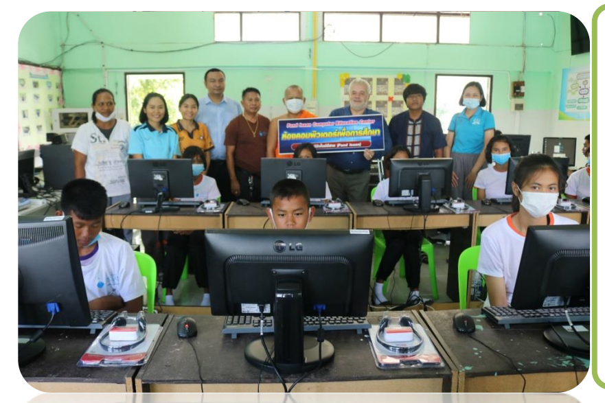
Figure 15: Fund Isaan computer classroom at Matthayom Jaraphat Witthaya School sponsored by VZW Thaise Vrienden Wevelgem