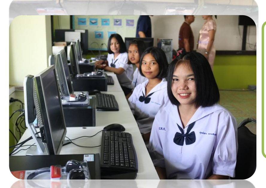
Figure 16: Fund Isaan computer classroom at Ban Kadad School sponsored by VZW Thaise Vrienden Wevelgem

The total cost for the Computer Classroom project 2020 was 670.616,00 Thai Baht (19.312.45 Euro).