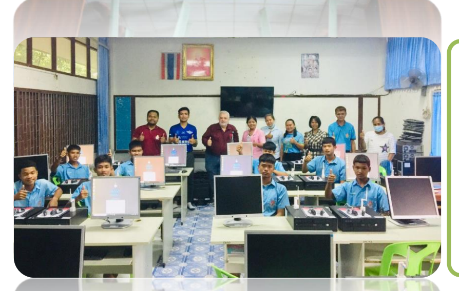
Figure 13: Fund Isaan computer classroom at Ban Kadad School sponsored by VZW Thaise Vrienden Wevelgem