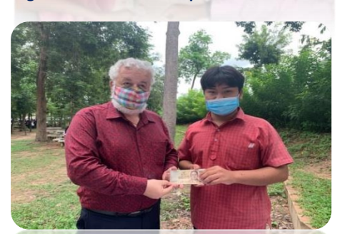
Figure 4: New Scholarship Student 2020-Beam