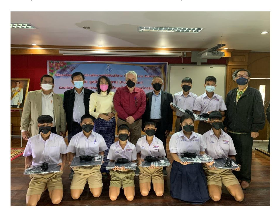
Figure 5: handing out computers to our scholarship students for online learning

In 2021 approximately 25 of our active students will graduate. As mentioned above we believe that our personal contacts with our students is at least as important as the financial support we give them, for that reason and bearing in mind our limited resources we do not want to increase the number of active students in the program. As one of our main sponsors recently announced that they will gradually reduce their contribution over the coming three years we anticipate a decrease in students over the same period.